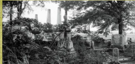
Thornhill Cemetery circa 1936