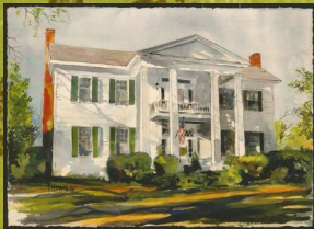
Thornhill circa 1835